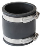
1056 Flexible Couplings